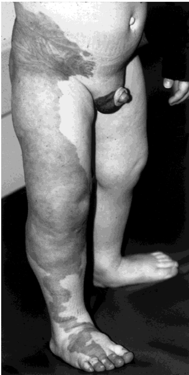
Fig. 3. Klippel-Trenaunay Syndrome involving the right lower extremity.

Treatment of slow-flow mixed-type malformations should emphasize compression garments to decrease the chronic lymphedema and venous engorgement since control of these symptoms may prevent or slow the skeletal hypertrophy seen in Klippel-Trenaunay syndrome [4,14,16,18]. Sclerotherapy, vein stripping, or debulking procedures can be done in selected instances, but evaluation with MRI or venographic studies is necessary beforehand to insure that anomalous superficial veins essential to extremity drainage are not removed [6]. Laser therapy is used for control of superficial vesicle formation. Sclerotherapy and staged debulking procedures are occasionally used for palliative treatment, however, complete excision of mixed malforma-