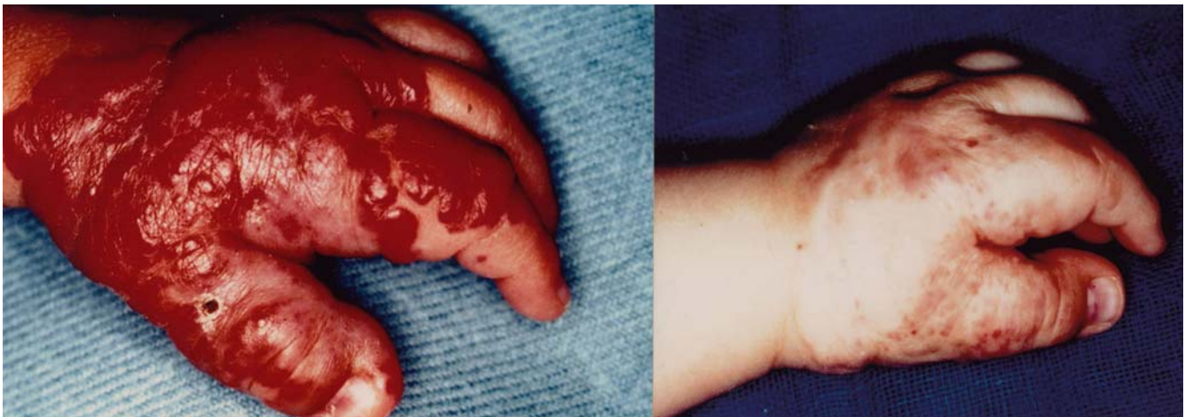
Figure 2 a) Massive hemangiomas on the left hand in a 6-month-old girl. b) Regression after three Nd:YAG laser treatments.

The postoperative hospital stay for all patients ranged from 1 to 2 days. Three weeks after treatment all lesions appeared with edema and with a slightly hard consistency. The size of the lesions had decreased only slightly. At the 6 week follow-up edema was no longer present, and all lesions had decreased in size so as not to interfere with vital functions. At the 6 month follow-up the results were clinically evident (see Table 2) (Fig. 1). A second session followed in 30 out of 38 patients in which, the initial re-